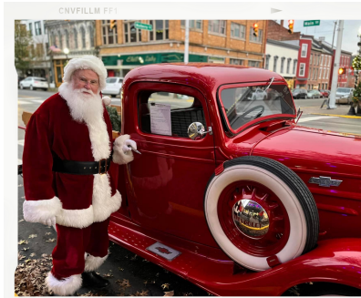
HOLIDAY OPEN HOUSE November 10th