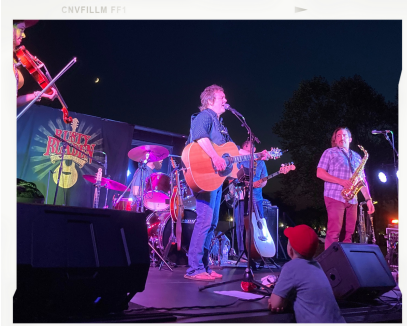
MUSIC IN THE PARK June 9, July 14, Aug. 11, Sept. 8