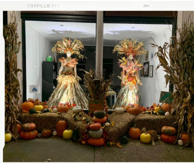
AUTUMN WINDOW DECORATION CONTEST October