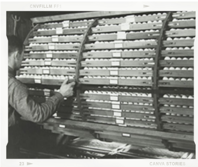
DOWNTOWN BUILDING HISTORY 1 PER YEAR