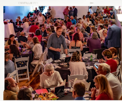
ANNUAL GALA & DESSERT AUCTION April 11