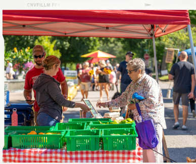
MADISON FARMERS MARKET Every Saturday Morning