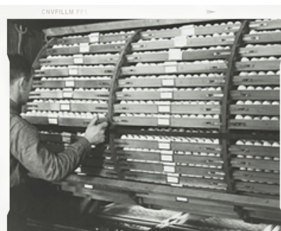
DOWNTOWN BUILDING HISTORY 1 PER YEAR