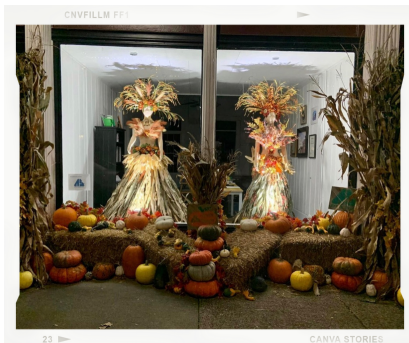
AUTUMN WINDOW DECORATION CONTEST October