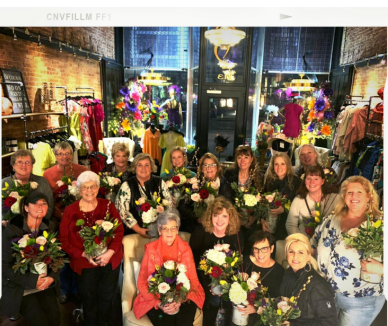
GIRLS WEEKEND March 3-5